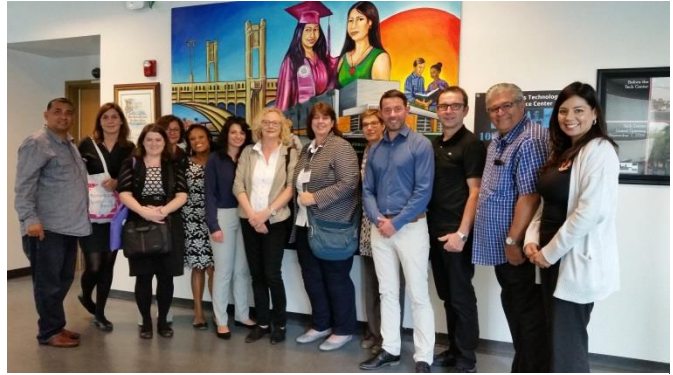
Boyle Heights Youth Source Center staff discussed its operations with members of LAUSD's Student Enrollment Placement Center and the Germany Welcome Committee of Trans-Atlantic exchange.