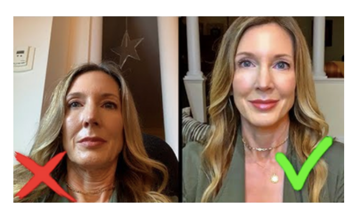
(Bad angle vs. Good angle)