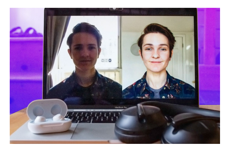
(Bad lighting vs. Good lighting)