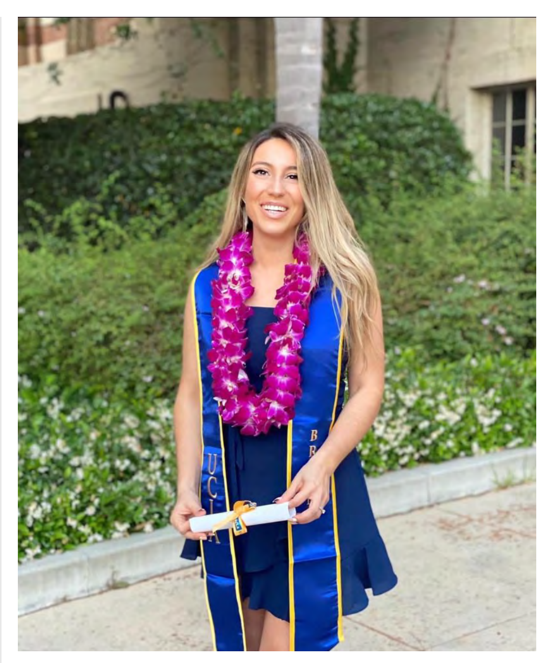
Harbor-Watts BusinessSource Center